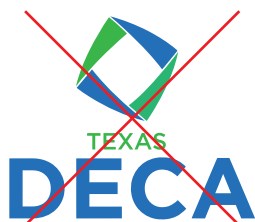
Don't alter approved colors.

A few rules are necessary for maintaining the integrity of the brand. Don't alter, stretch, distort, add or remove elements or rotate in any way. This also includes adding unattractive text elements and changing the color or typeface. Here are a few examples of ways you should not use the logo.