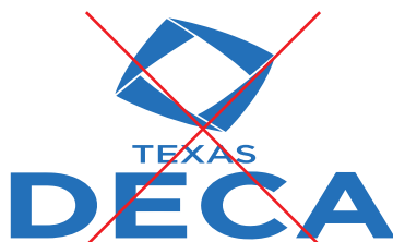
Don't stretch or distort the logo.